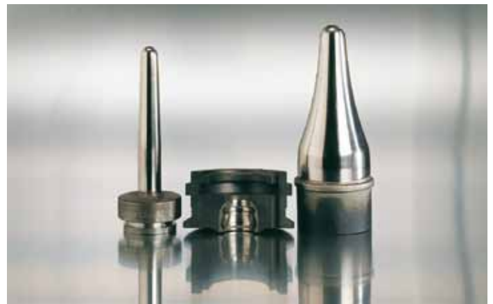
Bottle plunger and neck rings with high wear-resistant surfaces

Services, like the web shop ( www.hoganasthermalspray.com ), are designed to provide our customers with a straightforward way to be guided to the proper powder solution and to make online orders.