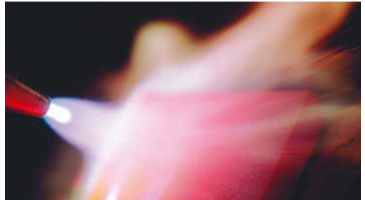
Flame spraying is ideal for coating cylindrical parts

This technique, typically used for glass moulds, smaller parts and repairs, uses a standard oxy-acetylene torch and powder fed into the flame from an attached hopper to achieve a smooth,