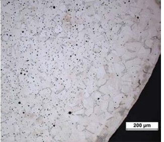
forMIM 316L.00 sintered unetched and etched microstructure at 7.9 g/cc density