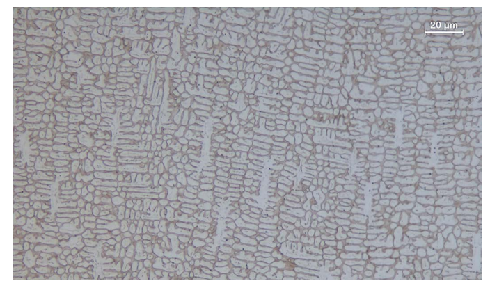
Martensite and carbide/boride (etched in glyceregia)